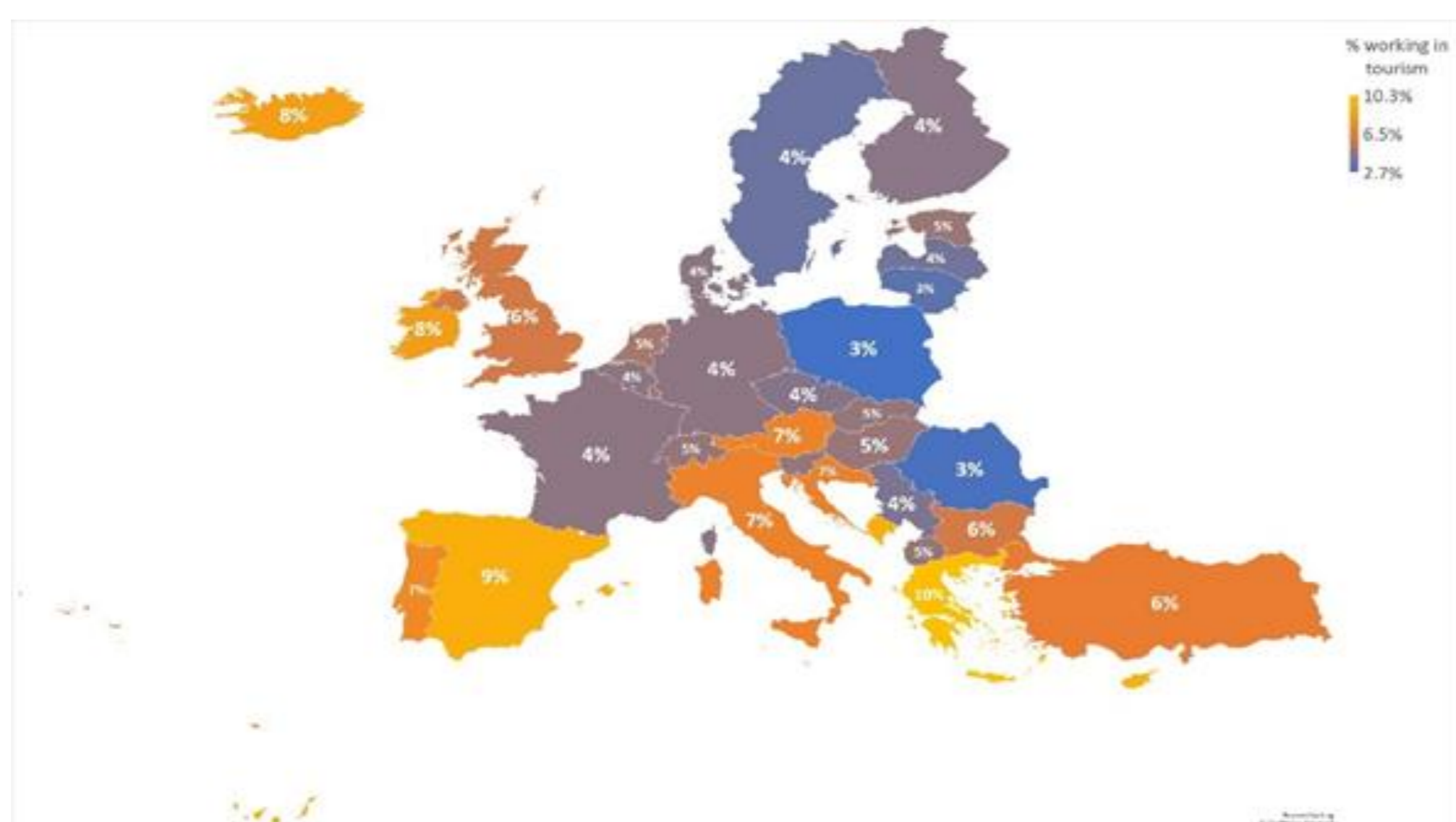
Figure 1. European overview of percentage of population employed in tourism-related sectors

The results highlight the fact that rural tourism has a significant impact on the economic and social development of the analyzed communities, but the effects are differentiated depending on the level of tourism development.